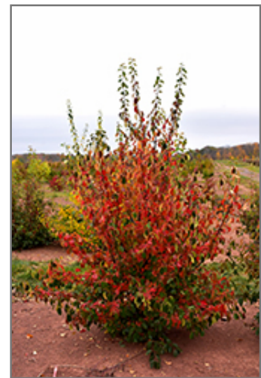
Chinese Quince in fall