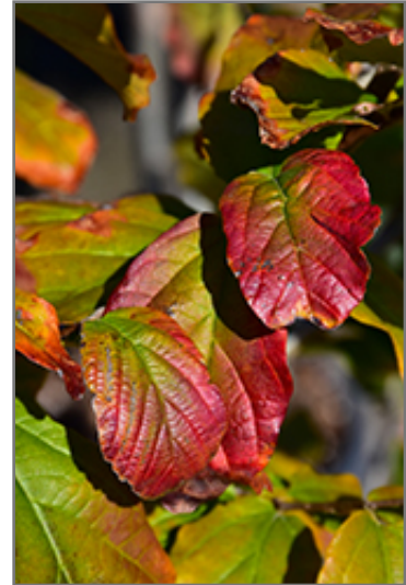
Ruby Vase Parrotia in fall

This tree should only be grown in full sunlight. It is very adaptable to both dry and moist locations, and should do just fine under average home landscape conditions. It may require supplemental watering during periods of drought or extended heat. It is not particular as to soil type or pH. It is highly tolerant of urban pollution and will even thrive in inner city environments. This is a selected variety of a species not originally from North America.