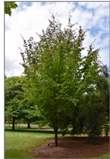
Ruby Vase Parrotia