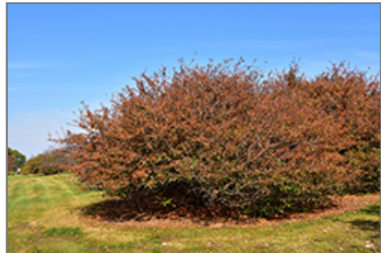
Satin Cloud Flowering Crab fruit

Satin Cloud Flowering Crab is recommended for the following landscape applications;