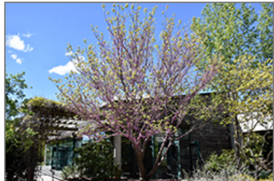
Flame Redbud in bloom

This tree does best in full sun to partial shade. It prefers to grow in average to moist conditions, and shouldn't be allowed to dry out. It may require supplemental watering during periods of drought or extended heat. It is not particular as to soil type or pH. It is highly tolerant of urban pollution and will even thrive in inner city environments, and will benefit from being planted in a relatively sheltered location. Consider applying a thick mulch around the root zone in winter to protect it in exposed locations or colder microclimates. This is a selection of a native North American species.