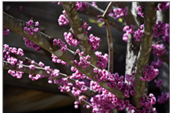
Flame Redbud flowers

Flame Redbud is recommended for the following landscape applications;