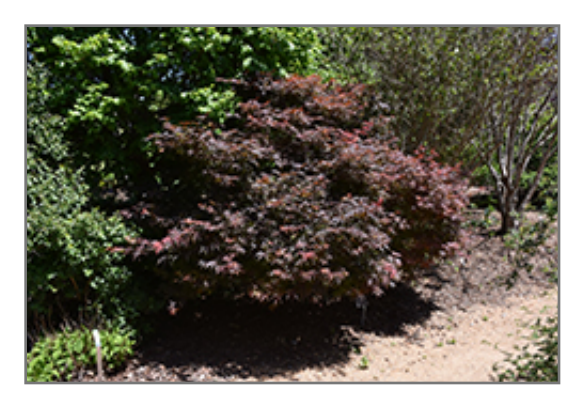
Orion Japanese Maple