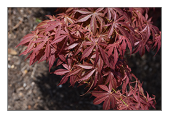
Orion Japanese Maple foliage