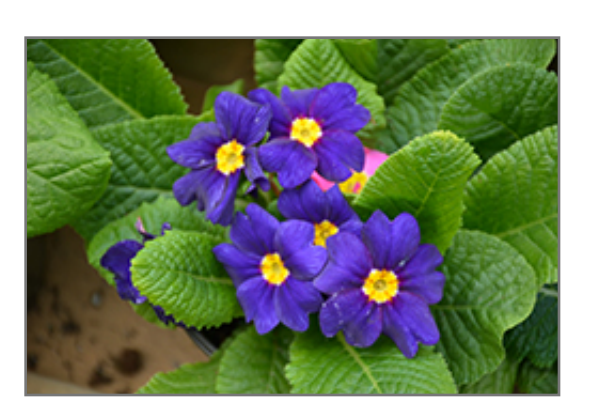
Lorien Blue Primrose flowers

When grown indoors, Lorien Blue Primrose can be expected to grow to be only 4 inches tall at maturity extending to 6 inches tall with the flowers, with a spread of 8 inches. It grows at a fast rate, and under ideal conditions can be expected to live for approximately 5 years. This houseplant performs well in both bright or indirect sunlight and strong artificial light, and can therefore be situated in almost any well-lit room or location. It requires an evenly moist well-drained soil for optimal growth, but will suffer if left to grow in standing water. The surface of the soil shouldn't be allowed to dry out completely, and so you should expect to water this plant once and possibly even twice each week. Be aware that your particular watering schedule may vary depending on its location in the room, the pot size, plant size and other conditions; if in doubt, ask one of our experts in the store for advice. It is not particular as to soil type or pH; an average potting soil should work just fine.