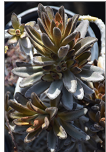
Chocolate Soldier Panda Plant

This is an herbaceous evergreen houseplant with a mounded form. This plant may benefit from an occasional pruning to look its best.