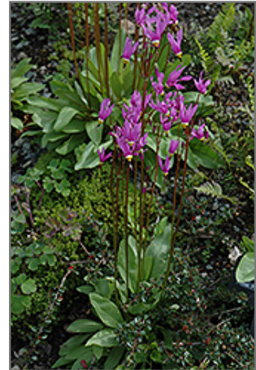
Shooting Star in bloom