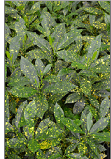
Gold Dust Variegated Croton foliage