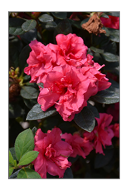
Encore Autumn Rouge Azalea flowers

When grown indoors, Encore Autumn Rouge Azalea can be expected to grow to be about 3 feet tall at maturity, with a spread of 3 feet. It grows at a slow rate, and under ideal conditions can be expected to live for approximately 40 years. This houseplant will do well in a location that gets either direct or indirect sunlight, although it will usually require a more brightly-lit environment than what artificial indoor lighting alone can provide. It requires an evenly moist well-drained soil for optimal growth, but will suffer if left to grow in standing water. The surface of the soil shouldn't be allowed to dry out completely, and so you should expect to water this plant once and possibly even twice each week. Be aware that your particular watering schedule may vary depending on its location in the room, the pot size, plant size and other conditions; if in doubt, ask one of our experts in the store for advice. It is very fussy about its soil conditions and must be grown in rich, acidic soil to ensure success. Contact the store for specific recommendations on pre-mixed potting soil for this plant.