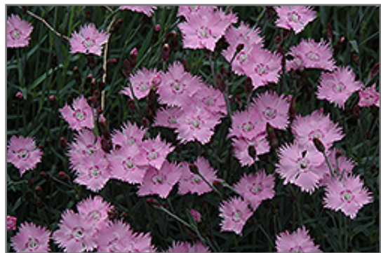
Bath's Pink Pinks flowers