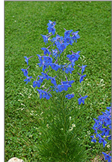
Chinese Delphinium flowers