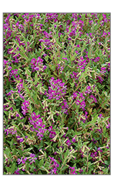
Sriracha Violet Cuphea flowers

There are many factors that will affect the ultimate height, spread and overall performance of a plant when grown indoors; among them, the size of the pot it's growing in, the amount of light it receives, watering frequency, the pruning regimen and repotting schedule. Use the information described here as a guideline only; individual performance can and will vary. Please contact the store to speak with one of our experts if you are interested in further details concerning recommendations on pot size, watering, pruning, repotting, etc.