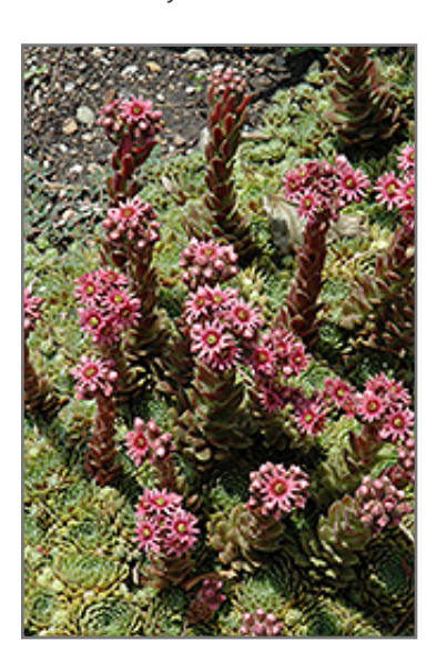
Pilioseum Hens And Chicks flowers