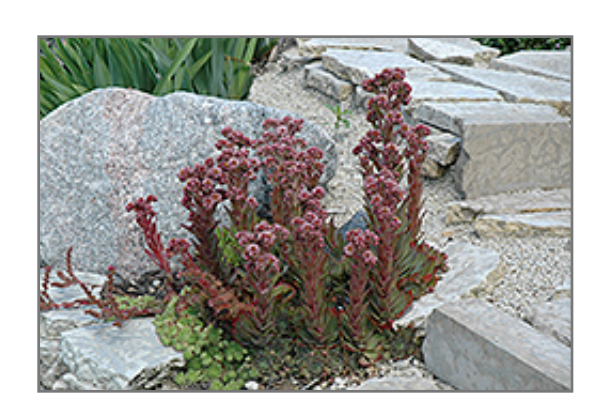
Kimono Hens And Chicks in bloom