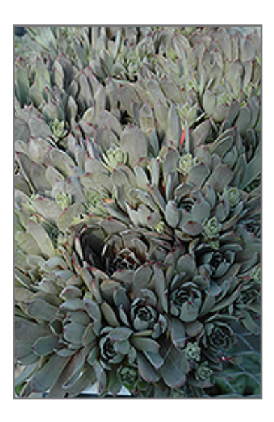
Big Blue Hens And Chicks

When grown indoors, Big Blue Hens And Chicks can be expected to grow to be only 4 inches tall at maturity extending to 12 inches tall with the flowers, with a spread of 12 inches. It grows at a medium rate, and under ideal conditions can be expected to live for approximately 20 years. This houseplant requires direct sun for optimal performance, and should therefore be situated in a room that gets bright sunlight for a good part of the day; it is not a good choice for rooms lit only by artificial light. It prefers dry to average moisture levels with very well-drained soil, and may die if left in standing water for any length of time. This plant should be watered when the surface of the soil gets dry, and will need watering approximately once each week. Be aware that your particular watering schedule may vary depending on its location in the room, the pot size, plant size and other conditions; if in doubt, ask one of our experts in the store for advice. It is not particular as to soil pH, but grows best in sandy soil. Contact the store for specific recommendations on pre-mixed potting soil for this plant.