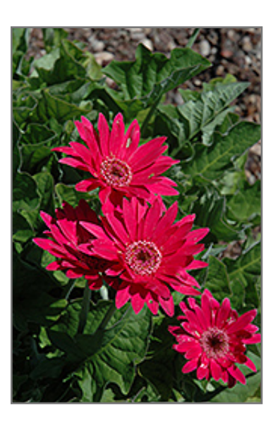
Garvinea Sweet Dreams Gerbera Daisy flowers

When grown indoors, Garvinea Sweet Dreams Gerbera Daisy can be expected to grow to be about 16 inches tall at maturity, with a spread of 18 inches. It grows at a fast rate, and under ideal conditions can be expected to live for approximately 3 years. This houseplant will do well in a location that gets either direct or indirect sunlight, although it will usually require a more brightly-lit environment than what artificial indoor lighting alone can provide. It does best in average to evenly moist soil, but will not tolerate standing water. The surface of the soil shouldn't be allowed to dry out completely, and so you should expect to water this plant once and possibly even twice each week. Be aware that your particular watering schedule may vary depending on its location in the room, the pot size, plant size and other conditions; if in doubt, ask one of our experts in the store for advice. It is not particular as to soil type or pH; an average potting soil should work just fine.