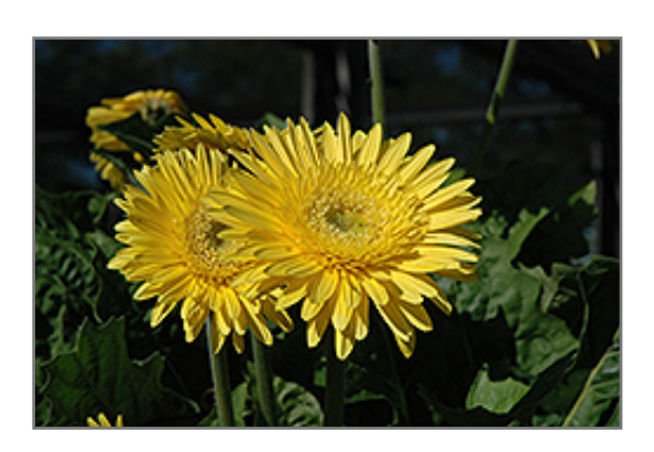
Funtastic Canary Gerbera Daisy flowers