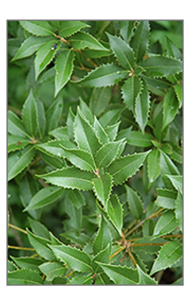
Fortune's Sweet Olive foliage

There are many factors that will affect the ultimate height, spread and overall performance of a plant when grown indoors; among them, the size of the pot it's growing in, the amount of light it receives, watering frequency, the pruning regimen and repotting schedule. Use the information described here as a guideline only; individual performance can and will vary. Please contact the store to speak with one of our experts if you are interested in further details concerning recommendations on pot size, watering, pruning, repotting, etc.