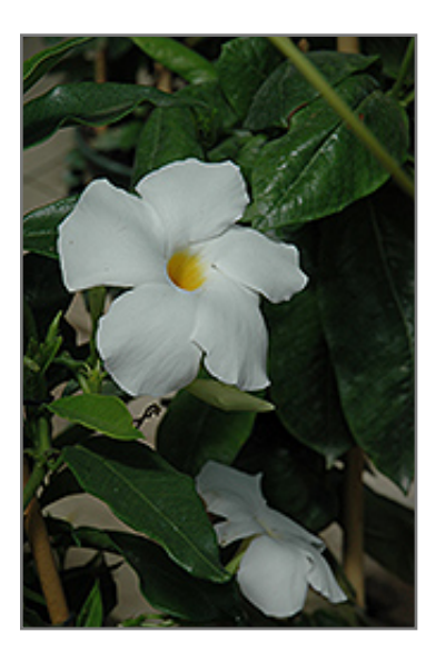
Sun Parasol White Mandevilla flowers

When grown indoors, Sun Parasol White Mandevilla can be expected to grow to be about 10 feet tall at maturity, with a spread of 24 inches. It grows at a medium rate, and under ideal conditions can be expected to live for approximately 20 years. This houseplant will do well in a location that gets either direct or indirect sunlight, although it will usually require a more brightly-lit environment than what artificial indoor lighting alone can provide. It requires an evenly moist well-drained soil for optimal growth. The surface of the soil shouldn't be allowed to dry out completely, and so you should expect to water this plant once and possibly even twice each week. Be aware that your particular watering schedule may vary depending on its location in the room, the pot size, plant size and other conditions; if in doubt, ask one of our experts in the store for advice. It is not particular as to soil type or pH; an average potting soil should work just fine. Be warned that parts of this plant are known to be toxic to humans and animals, so special care should be exercised if growing it around children and pets.