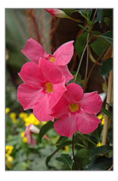
Sun Parasol Pretty Pink Mandevilla flowers

When grown indoors, Sun Parasol Pretty Pink Mandevilla can be expected to grow to be about 10 feet tall at maturity, with a spread of 24 inches. It grows at a medium rate, and under ideal conditions can be expected to live for approximately 20 years. This houseplant will do well in a location that gets either direct or indirect sunlight, although it will usually require a more brightly-lit environment than what artificial indoor lighting alone can provide. It requires an evenly moist well-drained soil for optimal growth. The surface of the soil shouldn't be allowed to dry out completely, and so you should expect to water this plant once and possibly even twice each week. Be aware that your particular watering schedule may vary depending on its location in the room, the pot size, plant size and other conditions; if in doubt, ask one of our experts in the store for advice. It is not particular as to soil type or pH; an average potting soil should work just fine. Be warned that parts of this plant are known to be toxic to humans and animals, so special care should be exercised if growing it around children and pets.