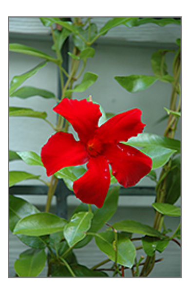
Sun Parasol Crimson Mandevilla flowers

When grown indoors, Sun Parasol Crimson Mandevilla can be expected to grow to be about 10 feet tall at maturity, with a spread of 24 inches. It grows at a medium rate, and under ideal conditions can be expected to live for approximately 20 years. This houseplant will do well in a location that gets either direct or indirect sunlight, although it will usually require a more brightly-lit environment than what artificial indoor lighting alone can provide. It requires an evenly moist well-drained soil for optimal growth. The surface of the soil shouldn't be allowed to dry out completely, and so you should expect to water this plant once and possibly even twice each week. Be aware that your particular watering schedule may vary depending on its location in the room, the pot size, plant size and other conditions; if in doubt, ask one of our experts in the store for advice. It is not particular as to soil type or pH; an average potting soil should work just fine. Be warned that parts of this plant are known to be toxic to humans and animals, so special care should be exercised if growing it around children and pets.