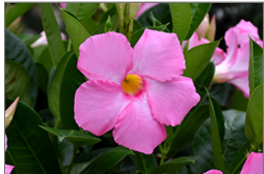
Pink Mandevilla flowers

This is a multi-stemmed evergreen houseplant with a spreading, ground-hugging habit of growth. This plant can be pruned at any time to keep it looking its best.