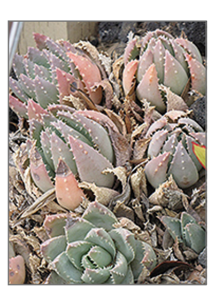
Large Short-leaved Aloe

When grown indoors, Large Short-leaved Aloe can be expected to grow to be about 12 inches tall at maturity extending to 24 inches tall with the flowers, with a spread of 24 inches. It grows at a slow rate, and under ideal conditions can be expected to live for approximately 40 years. This houseplant will do well in a location that gets either direct or indirect sunlight, although it will usually require a more brightly-lit environment than what artificial indoor lighting alone can provide. It prefers dry to average moisture levels with very well-drained soil, and may die if left in standing water for any length of time. This plant should be watered when the surface of the soil gets dry, and will need watering approximately once each week. Be aware that your particular watering schedule may vary depending on its location in the room, the pot size, plant size and other conditions; if in doubt, ask one of our experts in the store for advice. It is not particular as to soil pH, but grows best in sandy soil. Contact the store for specific recommendations on pre-mixed potting soil for this plant.