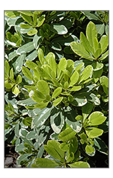
Mojo Dwarf Mock Orange foliage

When grown indoors, Mojo Dwarf Mock Orange can be expected to grow to be about 24 inches tall at maturity, with a spread of 3 feet. It grows at a slow rate, and under ideal conditions can be expected to live for approximately 40 years. This houseplant will do well in a location that gets either direct or indirect sunlight, although it will usually require a more brightly-lit environment than what artificial indoor lighting alone can provide. It does best in average to evenly moist soil, but will not tolerate standing water. The surface of the soil shouldn't be allowed to dry out completely, and so you should expect to water this plant once and possibly even twice each week. Be aware that your particular watering schedule may vary depending on its location in the room, the pot size, plant size and other conditions; if in doubt, ask one of our experts in the store for advice. It is not particular as to soil type or pH; an average potting soil should work just fine.