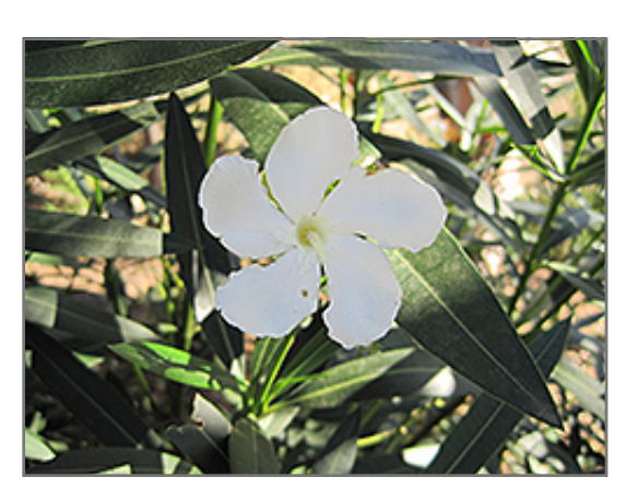
Sister Agnes Oleander flowers

When grown indoors, Sister Agnes Oleander can be expected to grow to be about 15 feet tall at maturity, with a spread of 15 feet. It grows at a fast rate, and under ideal conditions can be expected to live for approximately 20 years. This houseplant will do well in a location that gets either direct or indirect sunlight, although it will usually require a more brightly-lit environment than what artificial indoor lighting alone can provide. It is very adaptable to both dry and moist soil, and should do just fine under average home conditions. The surface of the soil shouldn't be allowed to dry out completely, and so you should expect to water this plant once and possibly even twice each week. Be aware that your particular watering schedule may vary depending on its location in the room, the pot size, plant size and other conditions; if in doubt, ask one of our experts in the store for advice. It is not particular as to soil pH, but grows best in poor soil. Contact the store for specific recommendations on pre-mixed potting soil for this plant. Be warned that parts of this plant are known to be toxic to humans and animals, so special care should be exercised if growing it around children and pets.