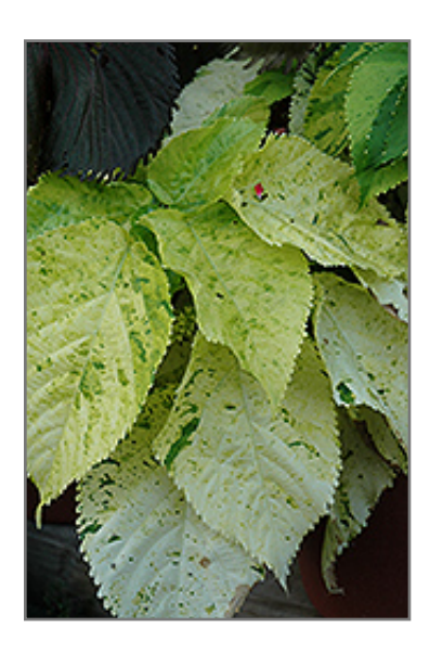
Tropical Tempest Copper Plant foliage

When grown indoors, Tropical Tempest Copper Plant can be expected to grow to be about 3 feet tall at maturity, with a spread of 3 feet. It grows at a fast rate, and under ideal conditions can be expected to live for approximately 30 years. This houseplant will do well in a location that gets either direct or indirect sunlight, although it will usually require a more brightly-lit environment than what artificial indoor lighting alone can provide. It prefers to grow in average to moist soil. The surface of the soil shouldn't be allowed to dry out completely, and so you should expect to water this plant once and possibly even twice each week. Be aware that your particular watering schedule may vary depending on its location in the room, the pot size, plant size and other conditions; if in doubt, ask one of our experts in the store for advice. It is not particular as to soil pH, but grows best in rich soil. Contact the store for specific recommendations on pre-mixed potting soil for this plant. Be warned that parts of this plant are known to be toxic to humans and animals, so special care should be exercised if growing it around children and pets.