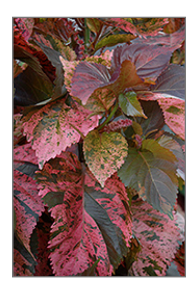
Beyond Paradise Copperleaf foliage

When grown indoors, Beyond Paradise Copperleaf can be expected to grow to be about 4 feet tall at maturity, with a spread of 3 feet. It grows at a fast rate, and under ideal conditions can be expected to live for approximately 30 years. This houseplant will do well in a location that gets either direct or indirect sunlight, although it will usually require a more brightly-lit environment than what artificial indoor lighting alone can provide. It prefers to grow in average to moist soil. The surface of the soil shouldn't be allowed to dry out completely, and so you should expect to water this plant once and possibly even twice each week. Be aware that your particular watering schedule may vary depending on its location in the room, the pot size, plant size and other conditions; if in doubt, ask one of our experts in the store for advice. It is not particular as to soil pH, but grows best in rich soil. Contact the store for specific recommendations on pre-mixed potting soil for this plant. Be warned that parts of this plant are known to be toxic to humans and animals, so special care should be exercised if growing it around children and pets.