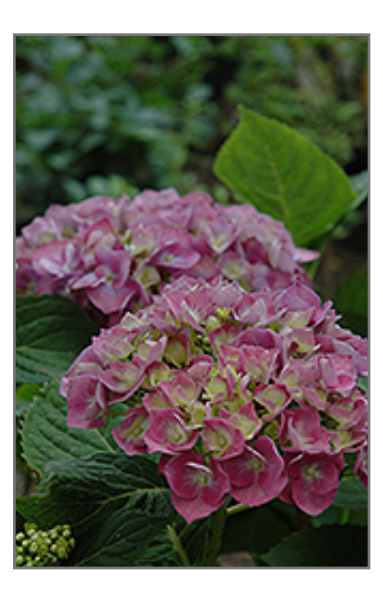
Forever And Ever Blue Heaven Hydrangea flowers

When grown indoors, Forever And Ever Blue Heaven Hydrangea can be expected to grow to be about 3 feet tall at maturity, with a spread of 30 inches. It grows at a fast rate, and under ideal conditions can be expected to live for approximately 20 years. This houseplant will do well in a location that gets either direct or indirect sunlight, although it will usually require a more brightly-lit environment than what artificial indoor lighting alone can provide. It requires an evenly moist well-drained soil for optimal growth. The surface of the soil shouldn't be allowed to dry out completely, and so you should expect to water this plant once and possibly even twice each week. Be aware that your particular watering schedule may vary depending on its location in the room, the pot size, plant size and other conditions; if in doubt, ask one of our experts in the store for advice. It is not particular as to soil type, but has a definite preference for acidic soil. Contact the store for specific recommendations on pre-mixed potting soil for this plant.