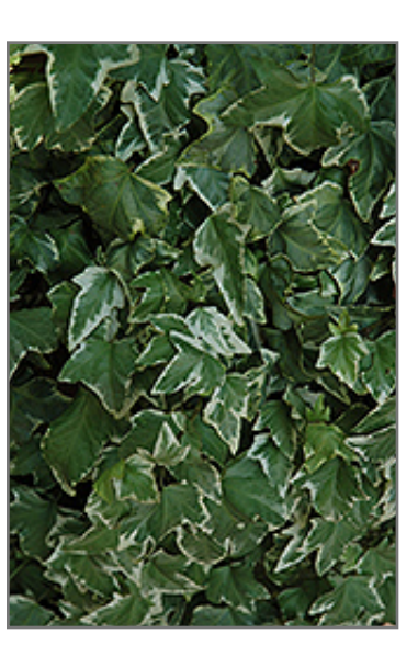
Bettina Ivy foliage

When grown indoors, Bettina Ivy can be expected to grow to be about 15 feet tall at maturity, with a spread of 3 feet. It grows at a medium rate, and under ideal conditions can be expected to live for approximately 30 years. This houseplant performs well in both bright or indirect sunlight and strong artificial light, and can therefore be situated in almost any well-lit room or location. It prefers to grow in average to moist soil. The surface of the soil shouldn't be allowed to dry out completely, and so you should expect to water this plant once and possibly even twice each week. Be aware that your particular watering schedule may vary depending on its location in the room, the pot size, plant size and other conditions; if in doubt, ask one of our experts in the store for advice. It is not particular as to soil pH, but grows best in rich soil. Contact the store for specific recommendations on pre-mixed potting soil for this plant. Be warned that parts of this plant are known to be toxic to humans and animals, so special care should be exercised if growing it around children and pets.