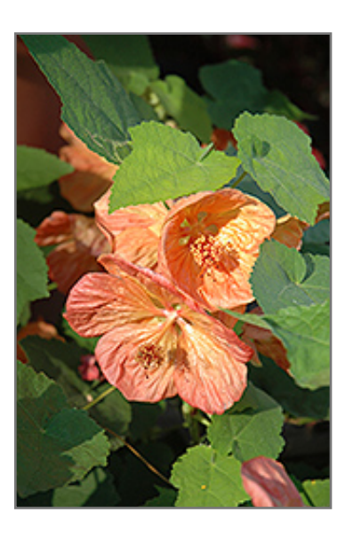
Bella Salmon Shades Flowering Maple flowers

When grown indoors, Bella Salmon Shades Flowering Maple can be expected to grow to be about 6 feet tall at maturity, with a spread of 6 feet. It grows at a medium rate, and under ideal conditions can be expected to live for approximately 20 years. This houseplant will do well in a location that gets either direct or indirect sunlight, although it will usually require a more brightly-lit environment than what artificial indoor lighting alone can provide. It prefers to grow in average to moist soil. The surface of the soil shouldn't be allowed to dry out completely, and so you should expect to water this plant once and possibly even twice each week. Be aware that your particular watering schedule may vary depending on its location in the room, the pot size, plant size and other conditions; if in doubt, ask one of our experts in the store for advice. It is not particular as to soil type or pH; an average potting soil should work just fine.