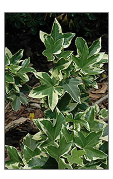
Bush Ivy foliage

There are many factors that will affect the ultimate height, spread and overall performance of a plant when grown indoors; among them, the size of the pot it's growing in, the amount of light it receives, watering frequency, the pruning regimen and repotting schedule. Use the information described here as a guideline only; individual performance can and will vary. Please contact the store to speak with one of our experts if you are interested in further details concerning recommendations on pot size, watering, pruning, repotting, etc.