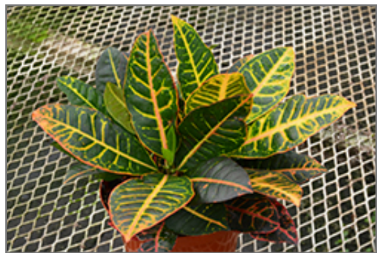
Petra Variegated Croton in full