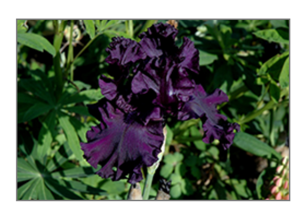
All Night Long Iris flowers