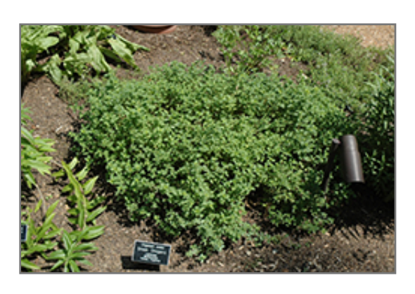
Greek Oregano

This is an herbaceous evergreen perennial herb with a mounded form. It brings an extremely fine and delicate texture to the garden composition and should be used to full effect. This is a relatively low maintenance plant, and should be cut back in late fall in preparation for winter. It is a good choice for attracting bees and butterflies to your yard, but is not particularly attractive to deer who tend to leave it alone in favor of tastier treats. It has no significant negative characteristics.