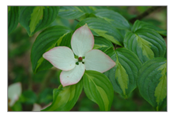
Gold Cup Chinese Dogwood flowers