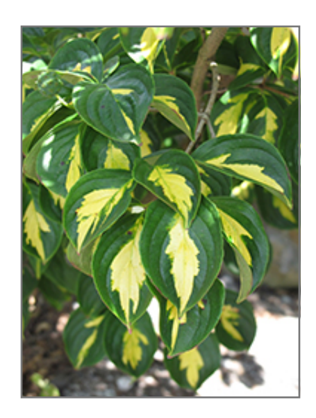
Gold Cup Chinese Dogwood foliage

8546 Sun Valley Road Anytown, USA 12345 204.782.4147