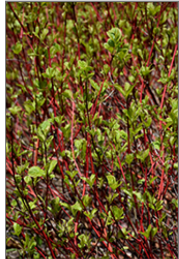
Westonbirt Dogwood stems