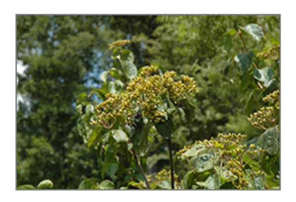
Michael Dodge Viburnum fruit

Michael Dodge Viburnum is recommended for the following landscape applications;