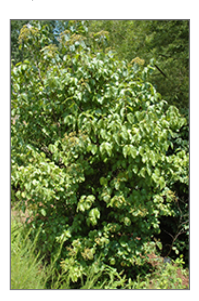
Michael Dodge Viburnum