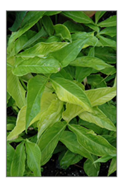
Dragon Tails Green Dragon foliage

Dragon Tails Green Dragon will grow to be about 10 inches tall at maturity extending to 15 inches tall with the flowers, with a spread of 12 inches. When grown in masses or used as a bedding plant, individual plants should be spaced approximately 10 inches apart. It grows at a fast rate, and under ideal conditions can be expected to live for approximately 10 years. As an herbaceous perennial, this plant will usually die back to the crown each winter, and will regrow from the base each spring. Be careful not to disturb the crown in late winter when it may not be readily seen!