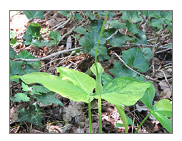
Dragon Tails Green Dragon flowers