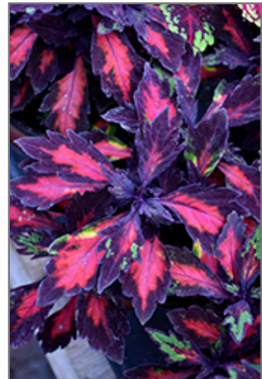
Marquee Special Effects Coleus foliage

Marquee Special Effects Coleus is recommended for the following landscape applications;