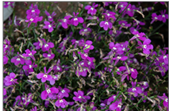
Lucia Ultraviolet Lobelia flowers

Lucia Ultraviolet Lobelia will grow to be about 12 inches tall at maturity, with a spread of 12 inches. When grown in masses or used as a bedding plant, individual plants should be spaced approximately 10 inches apart. Its foliage tends to remain dense right to the ground, not requiring facer plants in front. It grows at a fast rate, and under ideal conditions can be expected to live for approximately 5 years. As an herbaceous perennial, this plant will usually die back to the crown each winter, and will regrow from the base each spring. Be careful not to disturb the crown in late winter when it may not be readily seen!