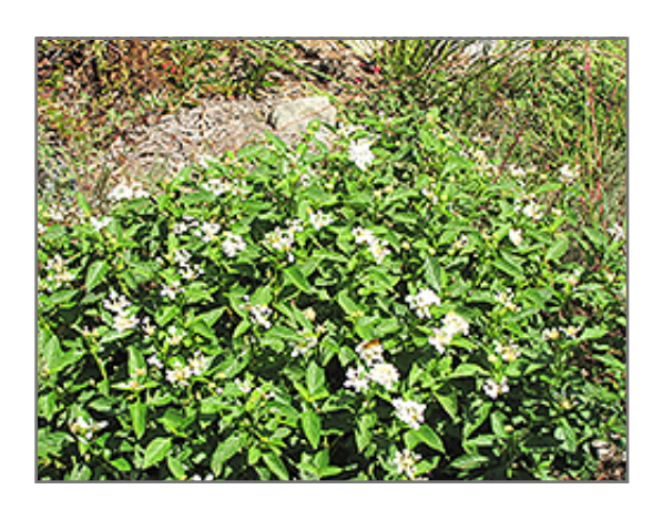
White Lightnin' Trailing Lantana in bloom

White Lightnin' Trailing Lantana is recommended for the following landscape applications;