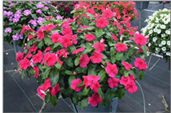
Valiant Punch Vinca in bloom