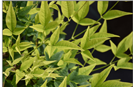
Lemon Lime Nandina foliage