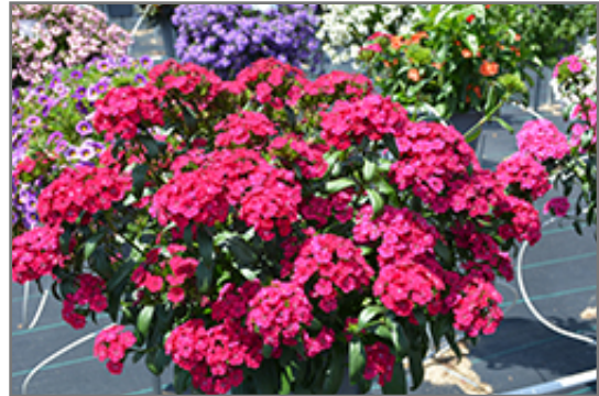
Jolt Cherry Hybrid Pinks in bloom