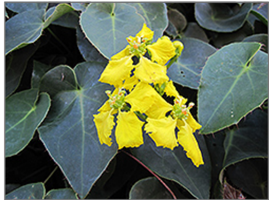
Orchid Vine flowers