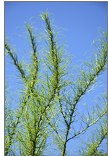
Mexican Palo Verde foliage

Mexican Palo Verde is a fine choice for the yard, but it is also a good selection for planting in outdoor pots and containers. Its large size and upright habit of growth lend it for use as a solitary accent, or in a composition surrounded by smaller plants around the base and those that spill over the edges. It is even sizeable enough that it can be grown alone in a suitable container. Note that when grown in a container, it may not perform exactly as indicated on the tag - this is to be expected. Also note that when growing plants in outdoor containers and baskets, they may require more frequent waterings than they would in the yard or garden.