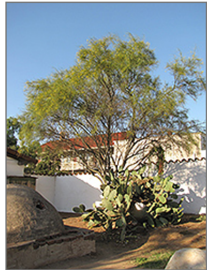
Mexican Palo Verde in bloom

Mexican Palo Verde is recommended for the following landscape applications;