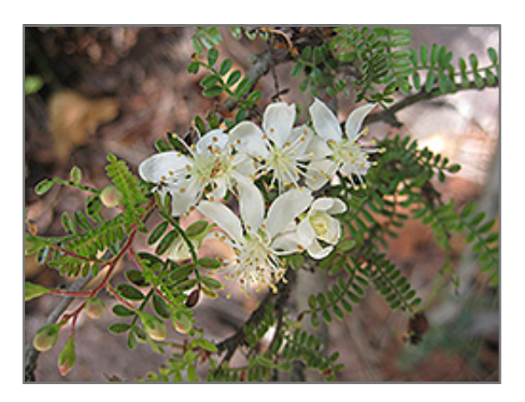
Ulei flowers