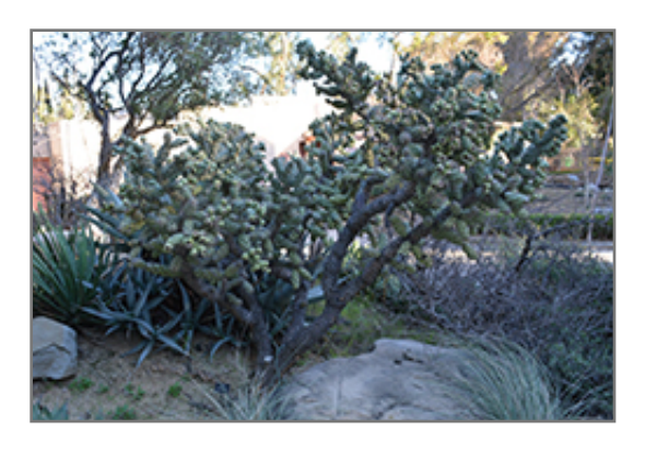
Cholla Cactus