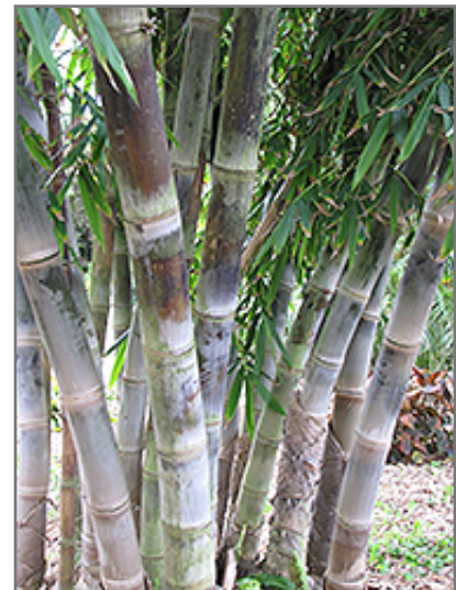
Betung Hitam Black Asper Bamboo bark