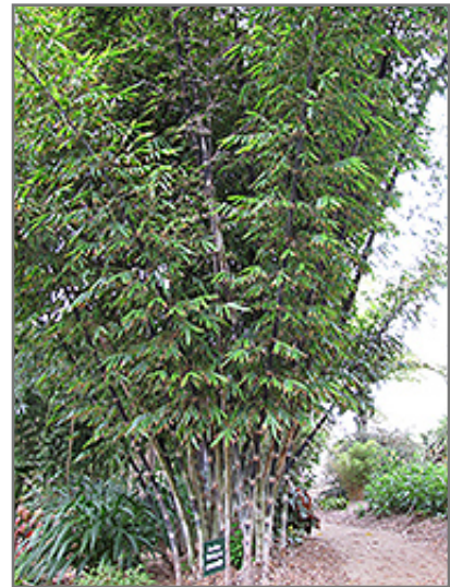
Betung Hitam Black Asper Bamboo

Betung Hitam Black Asper Bamboo is a fine choice for the garden, but it is also a good selection for planting in outdoor pots and containers. Its large size and upright habit of growth lend it for use as a solitary accent, or in a composition surrounded by smaller plants around the base and those that spill over the edges. It is even sizeable enough that it can be grown alone in a suitable container. Note that when growing plants in outdoor containers and baskets, they may require more frequent waterings than they would in the yard or garden.